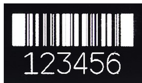
Bar Code/Lot Number